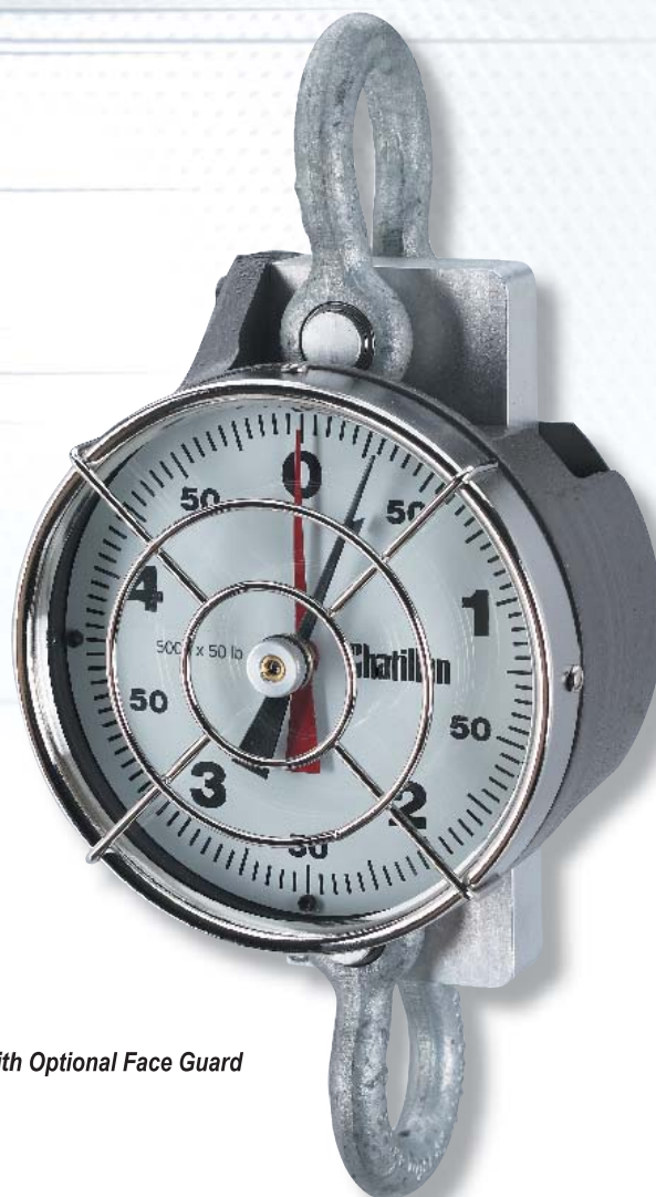
Shown with Optional Face Guard