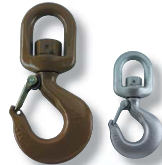
Swivel Hook - SH