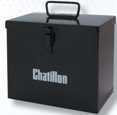
Optional Carrying Case

Notes: Dynamometers with "EH" come standard with Eye Hook. Dynamometer with "SH" come standard with Swivel Hook. Add suffix "FG" after the model number if you require the Wire Face Guard. Carrying Case must be ordered separately.