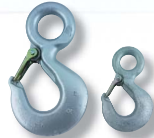
Eye Hook - EH