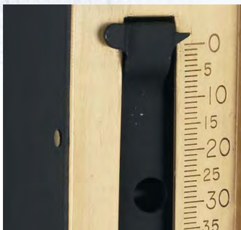
Easy to read graduations