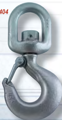
Standard Swivel Hooks

Visit Us on the Web at www.chatillon.com