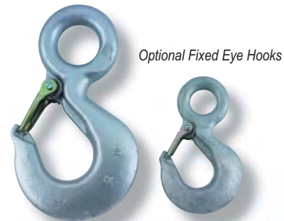
Optional Fixed Eye Hooks

Notes: For complete specifications and dimensions for all dynamometer hooks and shackles, please reference Specification Sheet SS-Hooks.