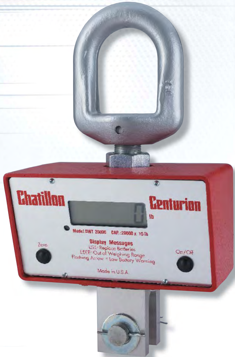
Shown without Standard Swivel Hook