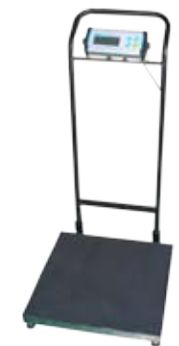
CPWplus - M