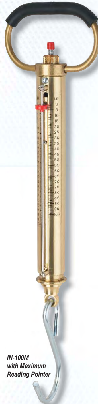
IN-100M with Maximum Reading Pointer