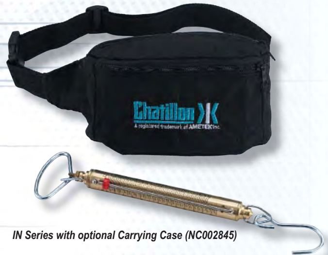
IN Series with optional Carrying Case (NC002845)