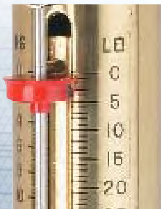
Maximum Reading Pointer